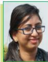
Chahat Teacher Learning center