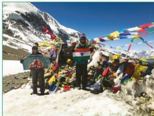
Climb to Thorong La pass, 5416 meters Annapurna Circuit, March 2018 in association with SledgeHammer Foundation and Pratham Books to raise fund to create a library for the underprivileged children. We were able to raise funds for over 500 books