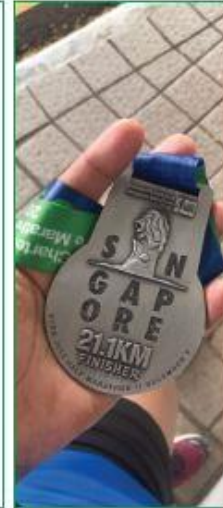
Standard Chartered Singapore Marathon, December 2018