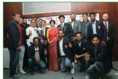
Winner, Pepsi Cup Prague 2018