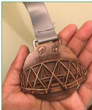
Airtel Delhi Half Marathon, ADHM, October 2018