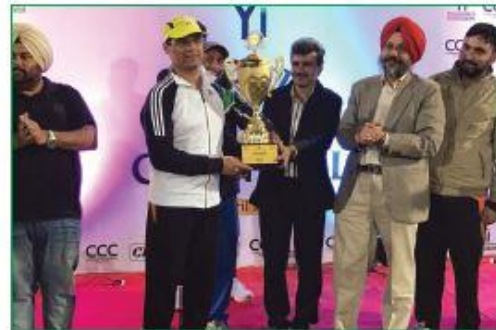
Winner of CII-YI Corporate Premier Cricket League Chandigarh 2018