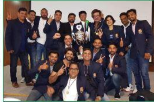
Winner, Pepsi Cup Prague 2017